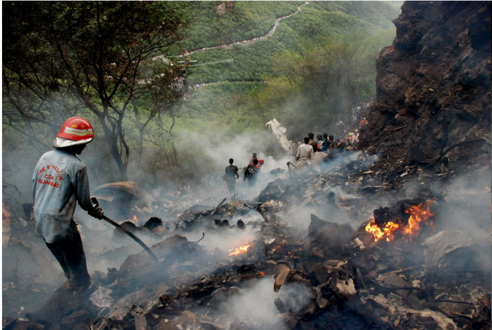
Rescue workers search the site of the crash of an Airblue passenger plane on the outskirts of Islamabad, Pakistan Wednesday.