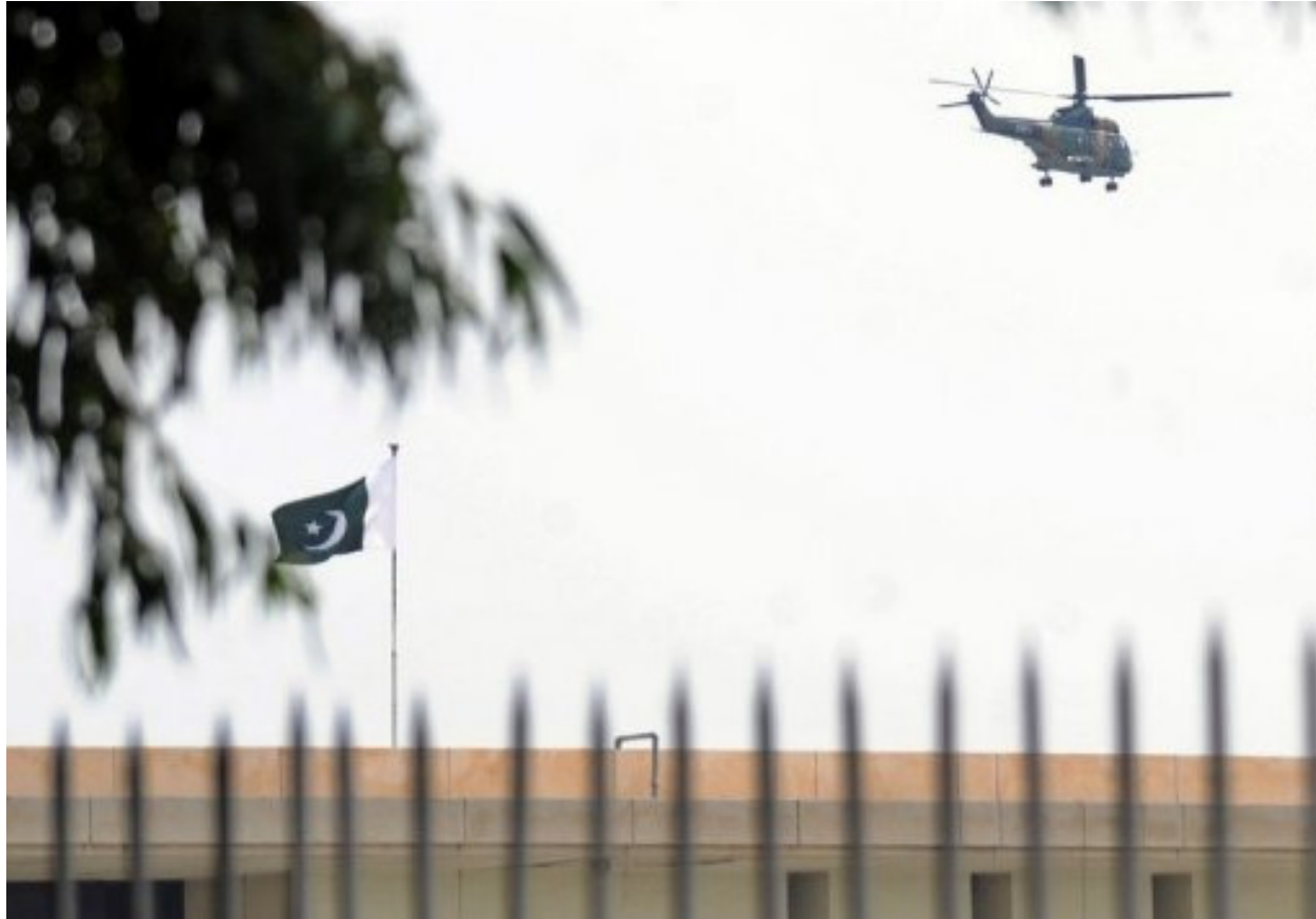
Helicopters have been helping rescuers reach a passenger plane which crashed in Islamabad