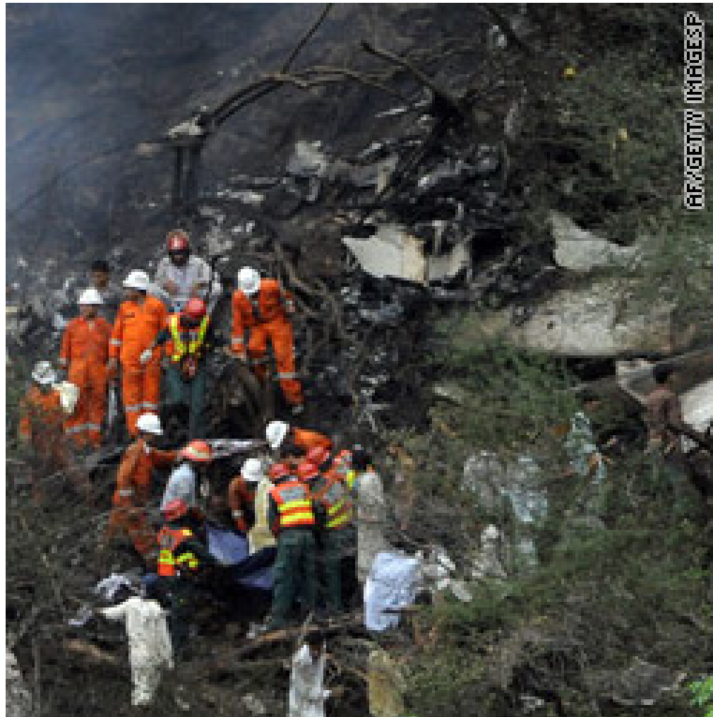
No survivors in Pakistan plane crash