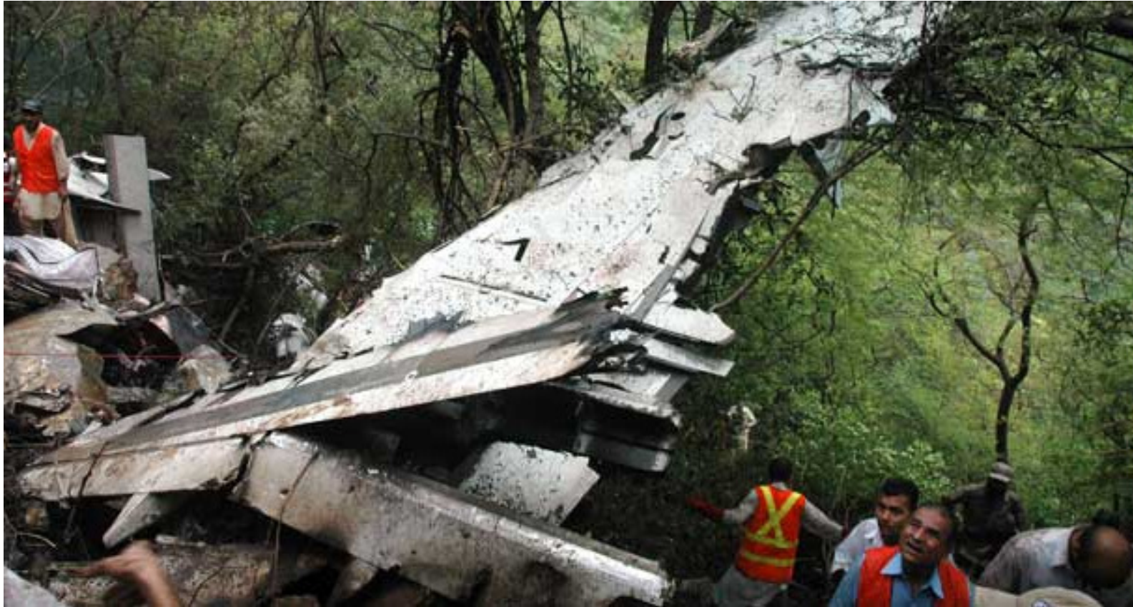
Pakistani rescuers surround the wreckage of a plane that crashed with 152 people on board, in Islamabad, Pakistan on Wednesday, July 28, 2010.