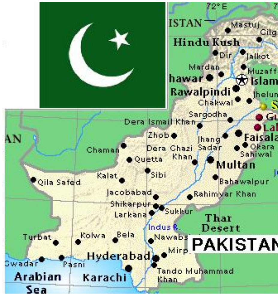
Location of Margalla Hills in Pakistan's capital Islamabad.