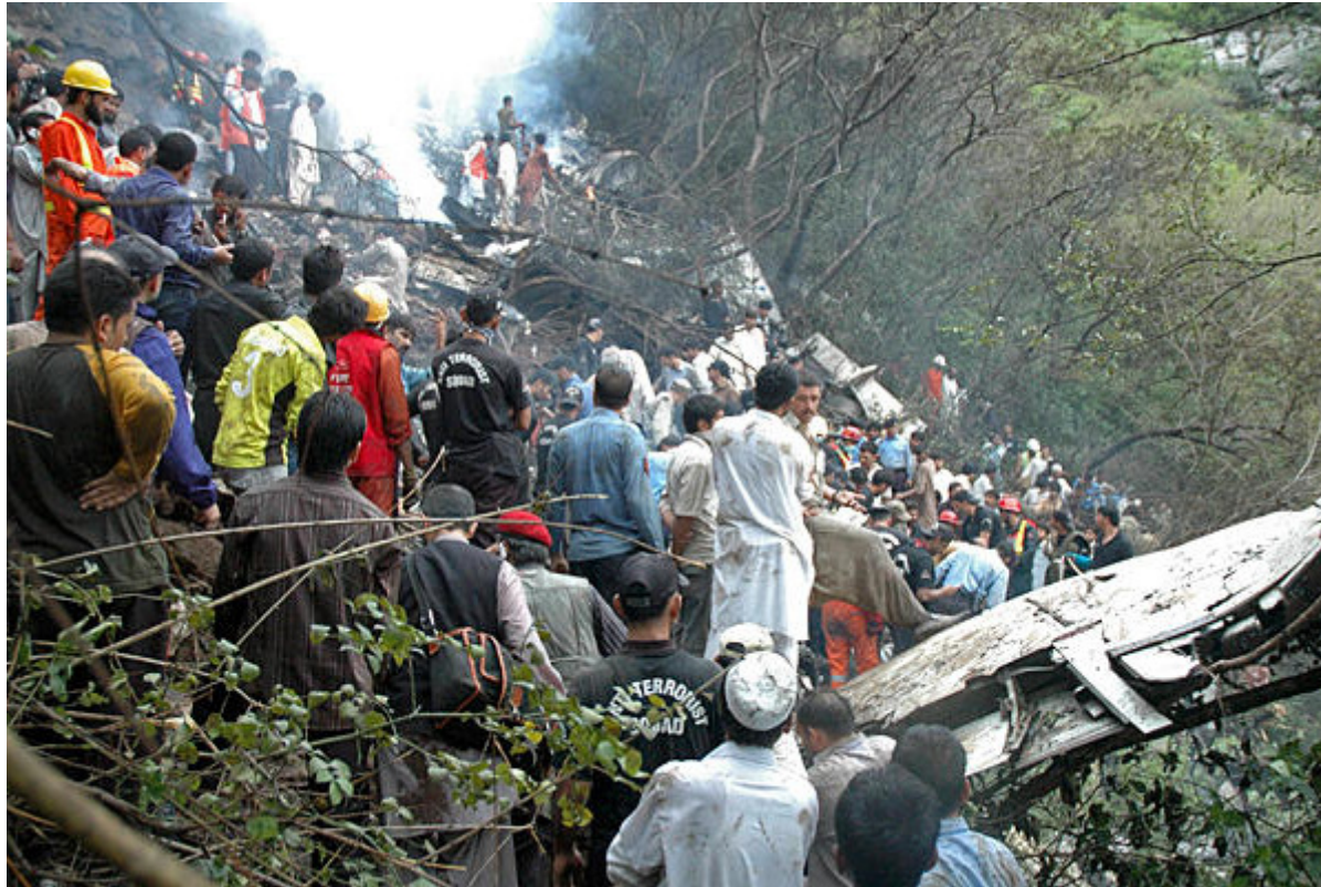
Rescue workers search the site of the crash of an Airblue passenger plane on the outskirts of Islamabad, Pakistan Wednesday.