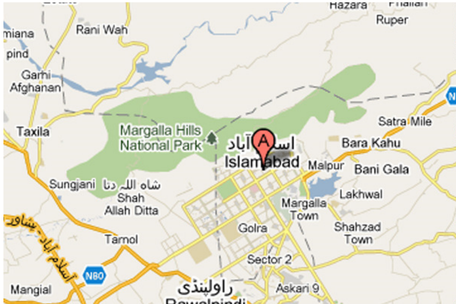
Location of Margalla Hills in Pakistan's capital Islamabad.